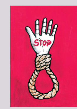
Kawaya L. Institute of Gombe, Kinshasa, Democratic Republic of Congo